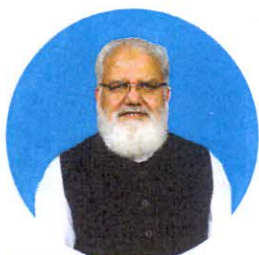
Mr. Liaqat Baloch Vice Chairman